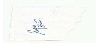
Signature of Faculty Member