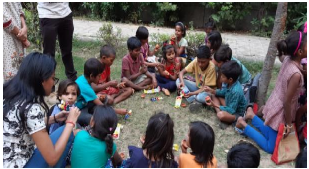
<u>Evidence Links</u> <u>https://www.instagram.com/p/CCD3t7ygApU/?igshid=YmMyMTA2M2Y=</u>