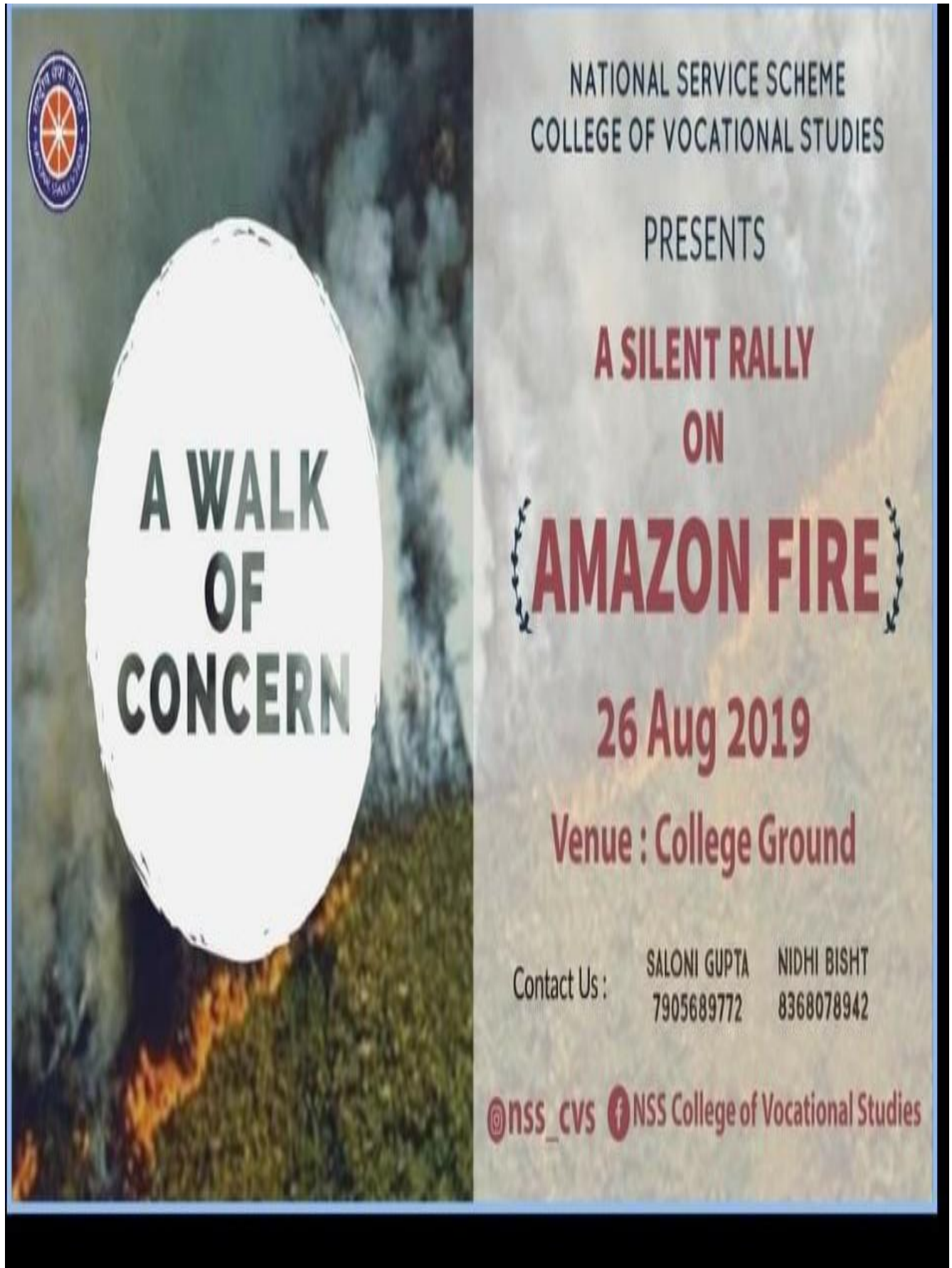
Poster of the event.