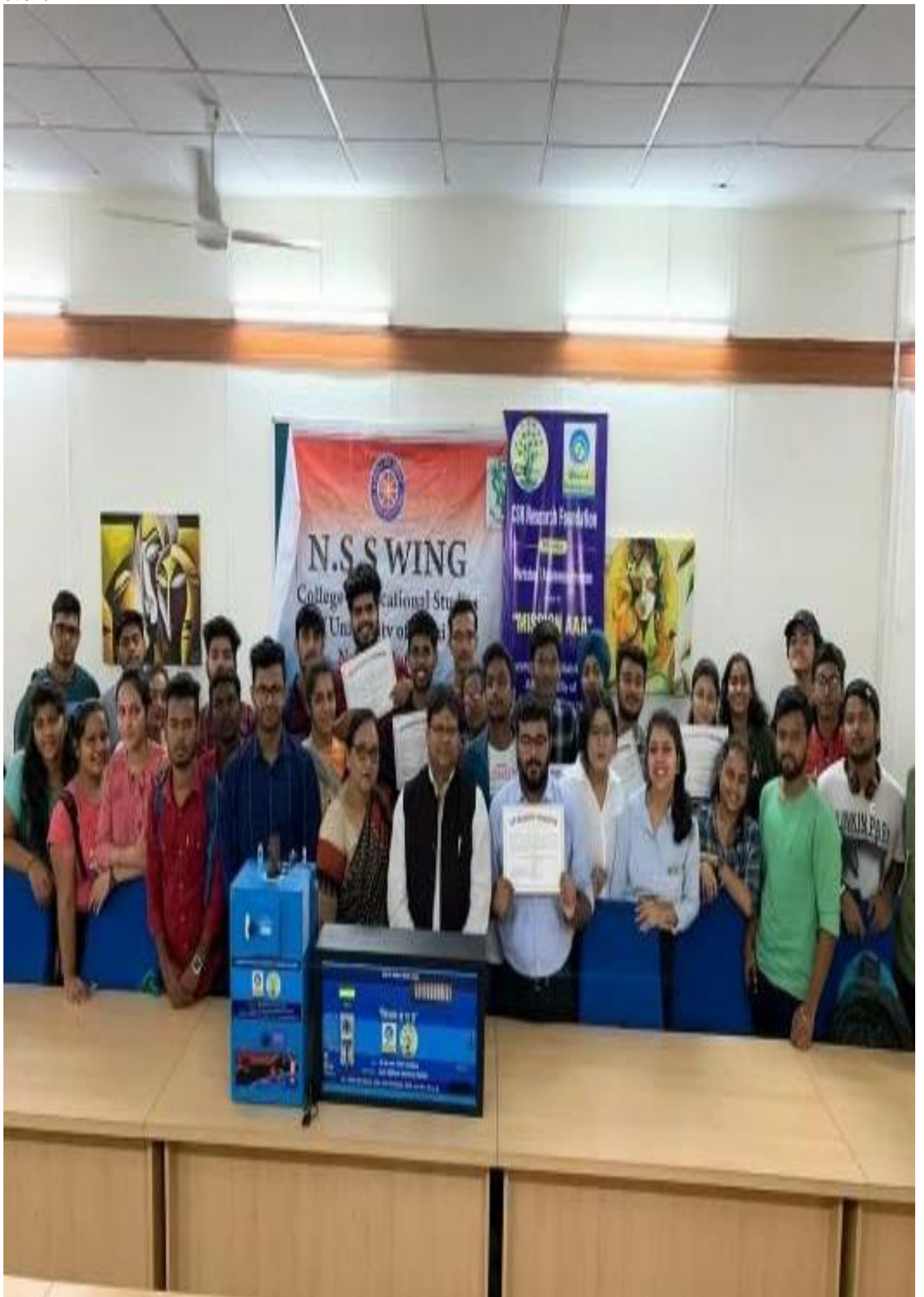
Photos of the event