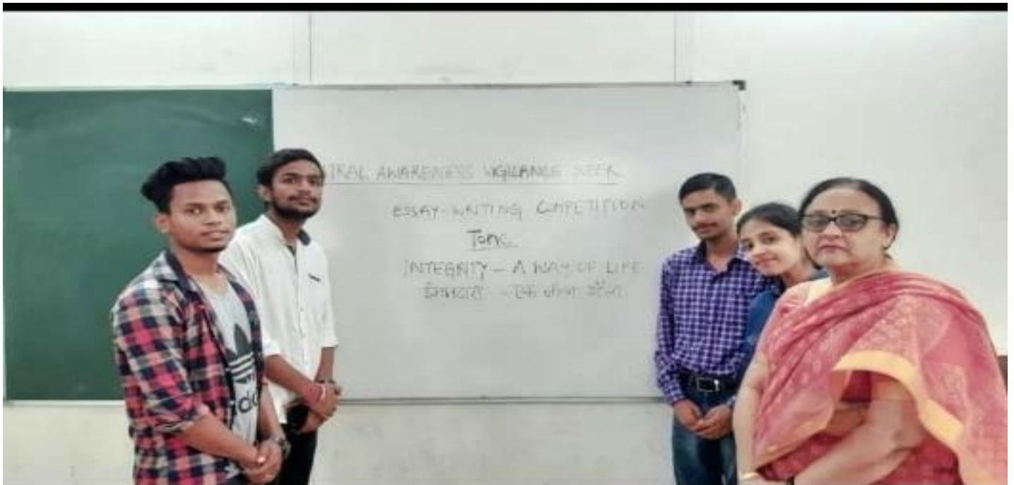
Photo of the event

https://www.instagram.com/p/B9qMAzDpYb_/?igshid=YmMyMTA2M2Y=