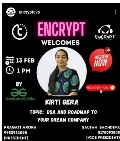
Poster for the session

Since DSA is an important subject for computer science students and anyone who is interested in computer science field so it also becomes necessary for them to know about it and have the roadmap for their dream job or company.