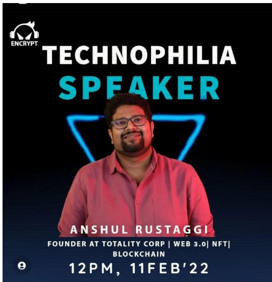
poster for the session

https://www.instagram.com/p/CZlfjBhpfuo/?igshid=NmNmNjAwNzg=