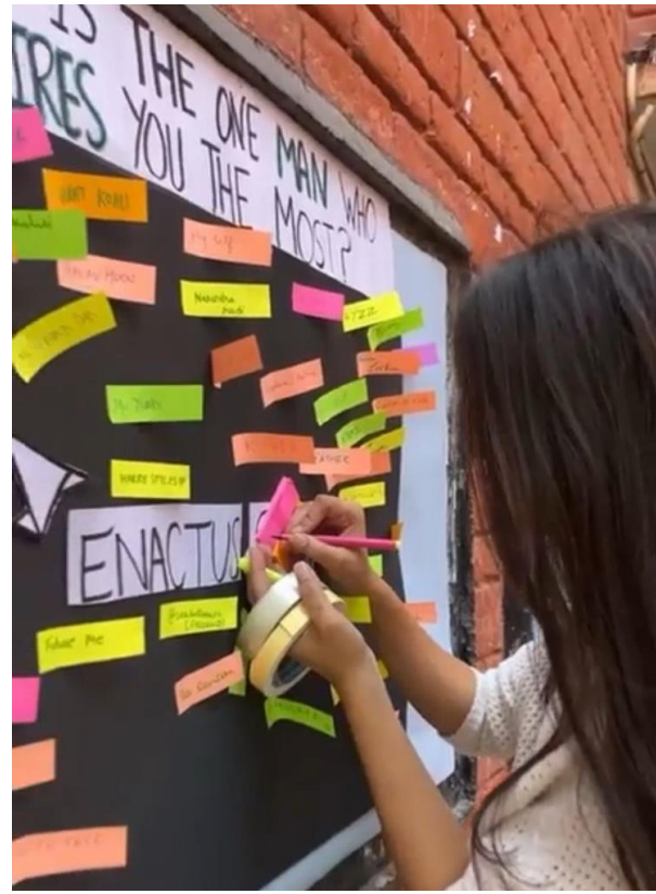
(International Men's Day- 18 th November 2022)