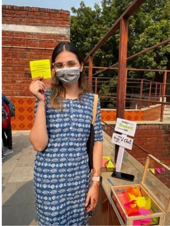
(World Kindness Day campaign)