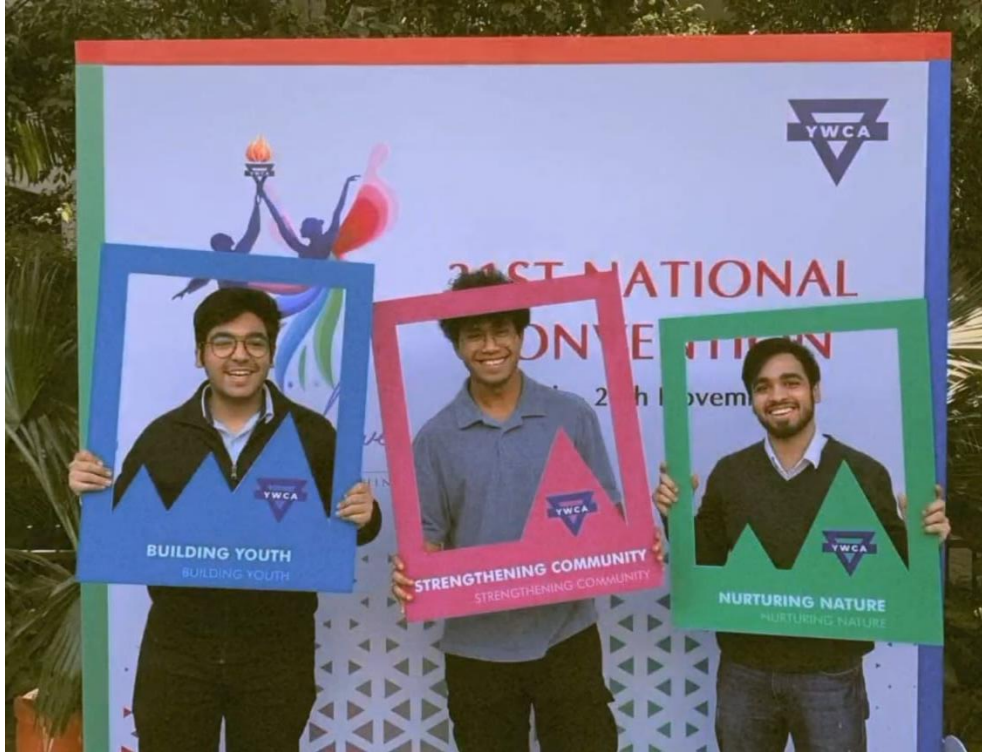
( Constitution Club- 19 th November 2022)