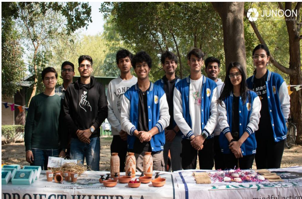
(NSUT stall- 15 February 2023)