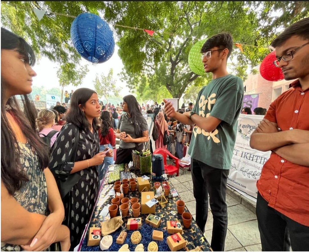
(Stall at JMC college- 4 th November)