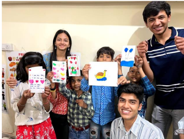
(Happiness Day campaign with Khushiyaan Foundation)