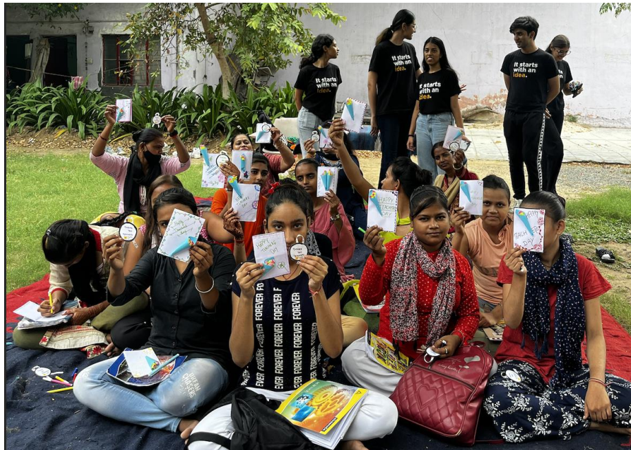
(Teachers Day Campaign at Sewa Bharti NGO- September 2022)