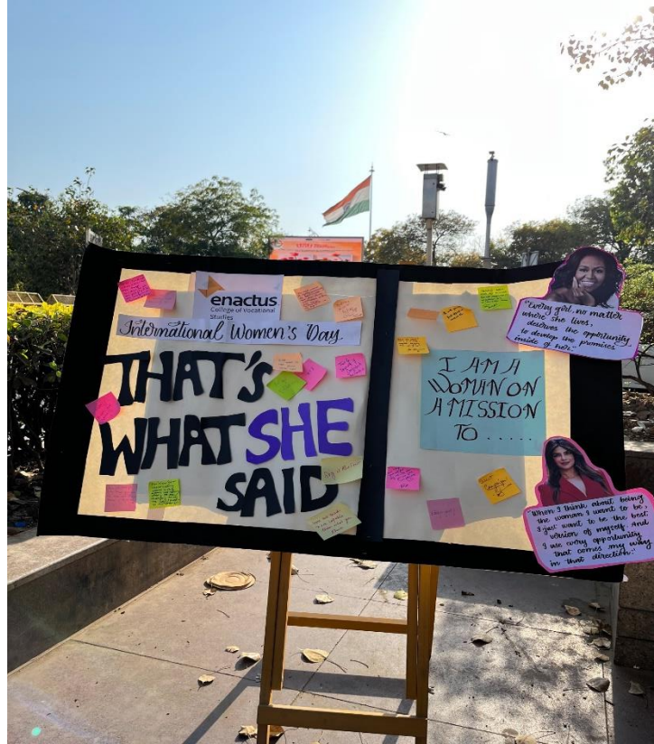
(International women's day- 3 rd March 2023)