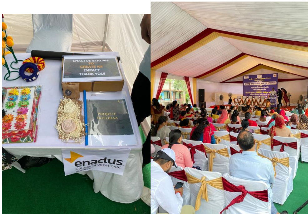
(Enactus CVS at community events at Najafgarh organised by Delhi Government)