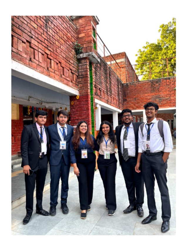
Seminar Hall 18th October 2022